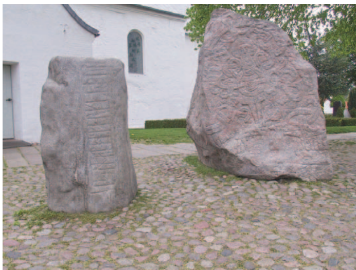
3. The small and the large runic stone measuring 1.40 m and 2.45 m above ground respectively.

It is now verified that the large runic stone is standing in its original position, erected by King Harald as a memorial stone to his parents Gorm and Thyra, as well as commemorating his own achievements gathering the Danish realm and christianizing the Danes. The smaller stone is King Gorm's memorial stone to Queen Thyra: 'King Gorm did these ruins after Thyra his wife, Denmark's grace'. The small stone has the runic scripture made horizontal in the traditional pagan way, whereas the large runic stone has horizontal lettering according to the new Latin scripture. The figure of the crucified Jesus is intertwined with animal ornamentation in the traditional pagan dragon style of the Viking Age. The two runic stones are a testimony to the transition from paganism to Christianity and for the first time in history the name of Denmark occurs. From the time of Gorm the Old, the list of Danish kings becomes coherent with an unbroken familiar lineage of all subsequent rulers, including the present Queen Margarethe II.