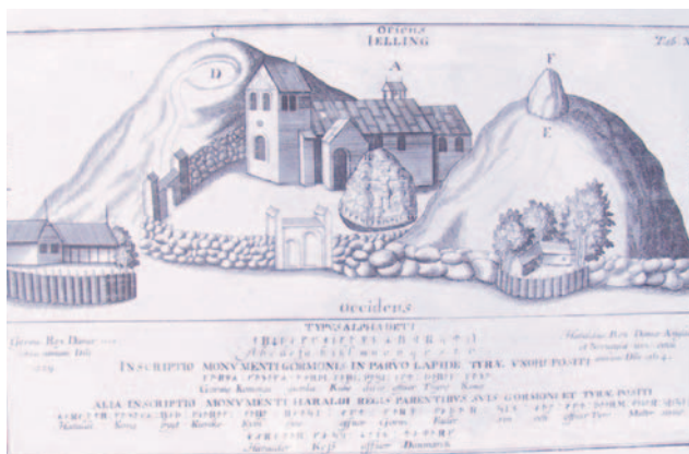
2. Rantzeu's prospectus of the Jelling monuments showing the large runic stone in a prominent position in the centre. The engraving was first published in Commentarii rerum memorabilium in Europa, Hamburg, 1591 .