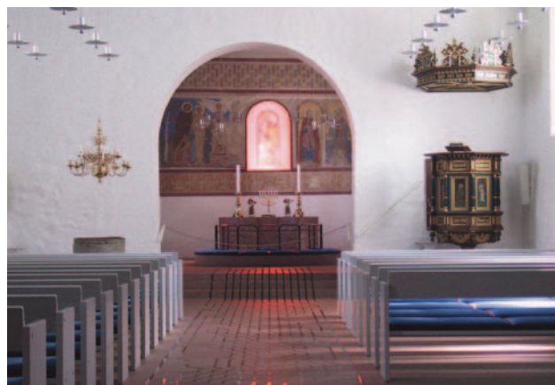
7. Interior of Jelling Church after refurbishment in 2000.