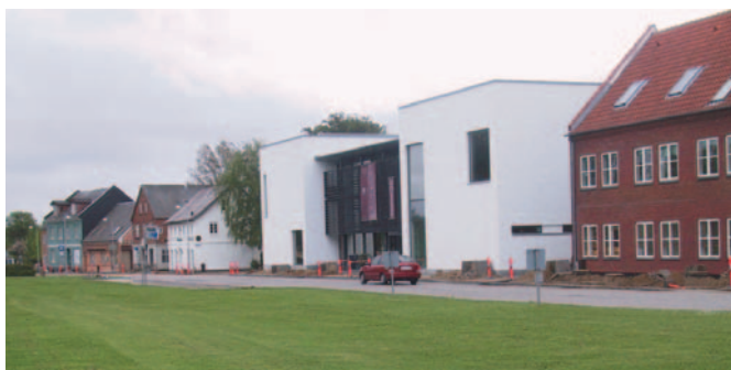
8. The visitor centre 'The Kings' Jelling' situated to the west of the monuments.