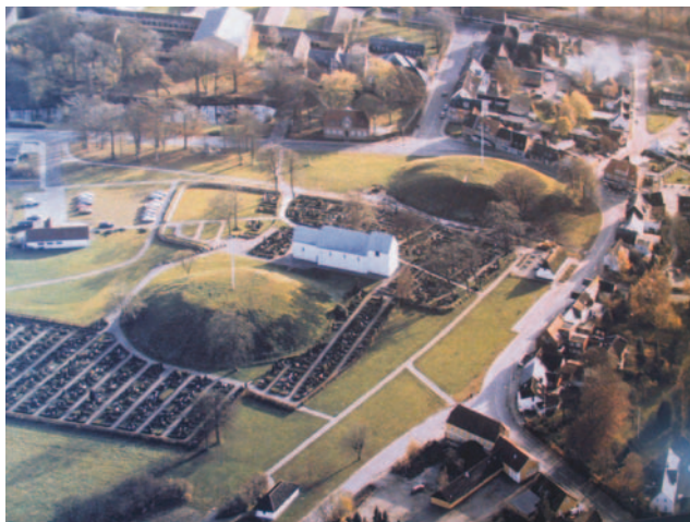
1. Aerial photograph of Jelling World Heritage site around 1980. Original in Antiquarian-topographical Archive, The National Museum of Denmark. © Flemming Aalund

The inscription was recommended by ICOMOS on the basis of criterion (iii): 'The Jelling complex, and especially the pagan burial mounds and the two runic stones are outstanding examples of the pagan Nordic culture'.